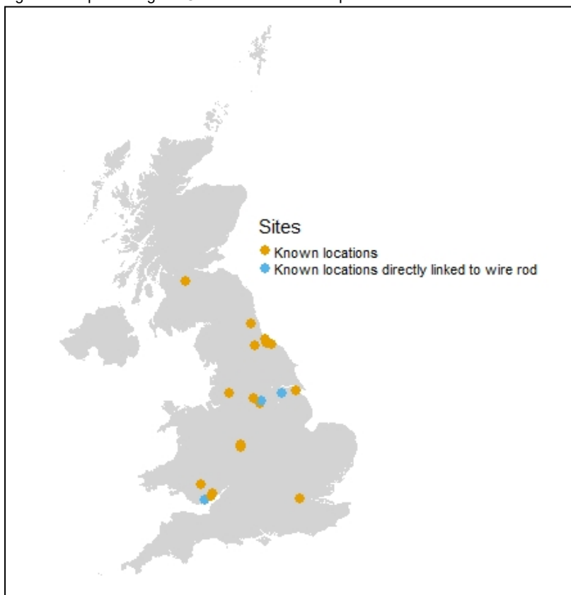
Figure 2: Map showing the UK locations of known producers of Wire Rod

Sources: Questionnaires, Companies House, Dun and Bradstreet Business Directory